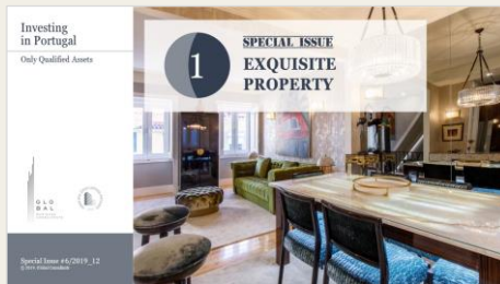
Special Issue: “Exquisite Property” (pdf)