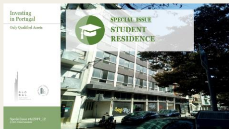
Special Issue: “Student Residences” (pdf)