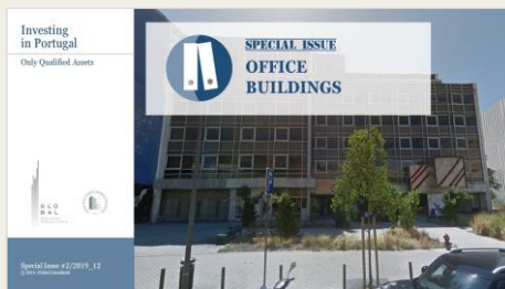
Special Issue: “Office Buildings” (pdf)