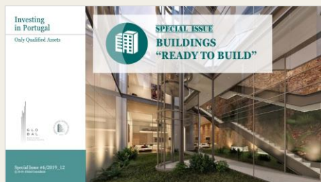
Special Issue: “Ready to Build Projects” (pdf)