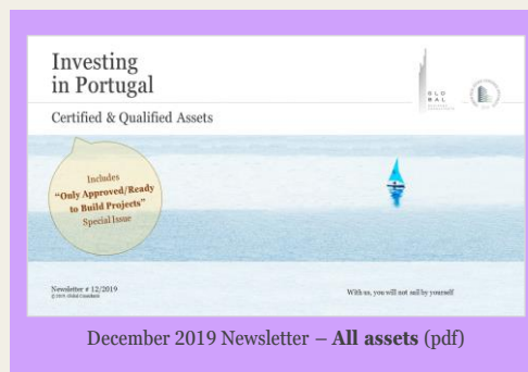
December 2019 Newsletter – All assets (pdf)