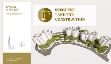
Special Issue: “Land for Construction” (pdf)